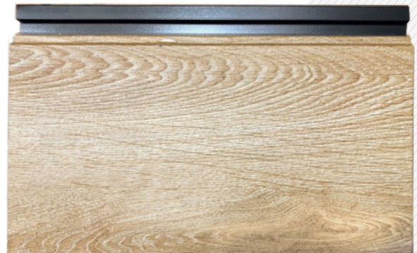
LYNX Board with complete removed Graffiti